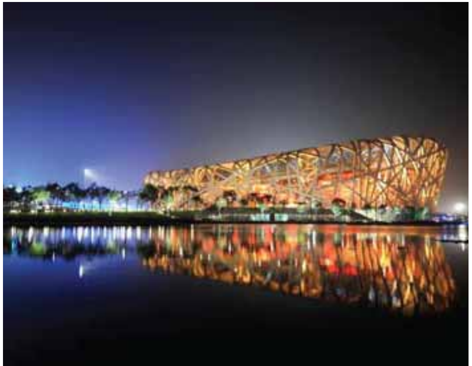
The 2008 Summer Olympics Opening Ceremonies at the “Bird's Nest”

In the center of the field, a huge, Chinese-style scroll, 147m x 22m (482' x 72'), became the focus of the action. The surface of the scroll was an LED screen across which images could flow. As the screen unrolled, at its center was an 11m x 20m (36' x 65.5') sheet of paper on which 15